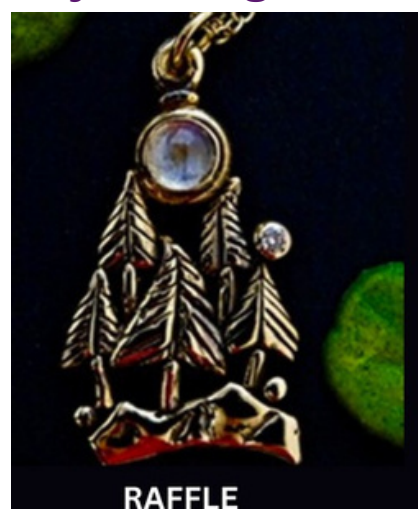
"Mountain Trees under the Moon & Stars". Moonstone & Diamond set in 14K Gold with 18" chain. Value $1450.