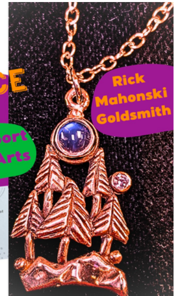
"Mountain Trees under the Moon & Stars". Moonstone & Diamond set in 14K Gold with 18" chain. Value $1450.